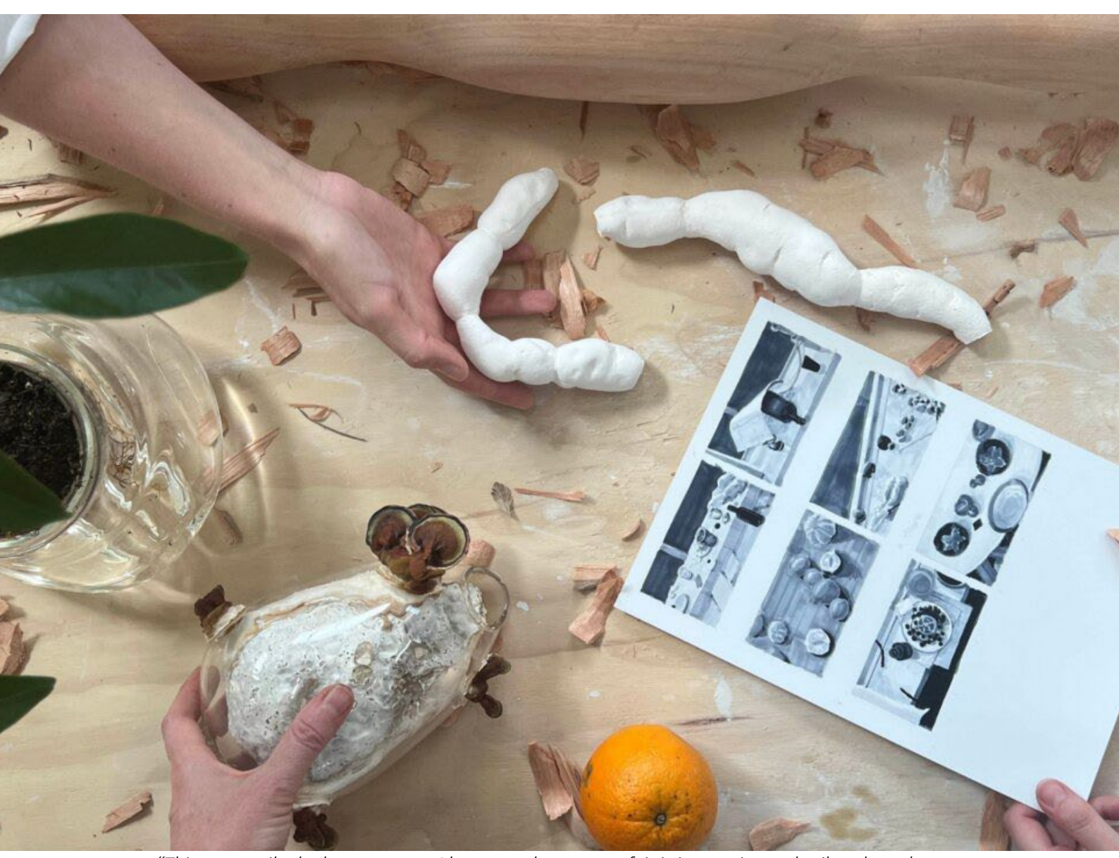
"This was easily the best program I have ever been part of, it is innovative and tailored to what we need. I am incredibly grateful for the time Metro Arts gave me." — MAVA Pathfinder Artist