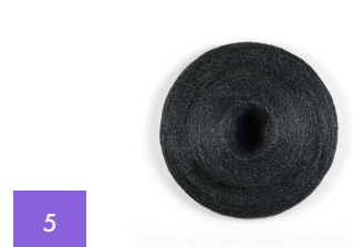
5 pit of despair 2023 Hand-coiled and stitched baling twine on timber frame 30.5 x 30.5 x 9.5cm $900