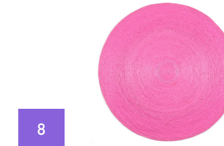
8 tumour target 2023 Hand-coiled and stitched baling twine 60 x 59.5cm $1,200