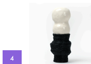
4 stubborn bodies (sentinel iii) 2024 Hand-coiled and stitched baling twine and porcelain paperclay with clear gloss glaze 23.3 x 8.5 x 8.5cm $500