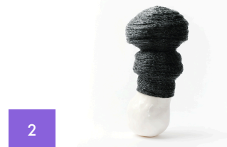
2 stubborn forces (sentinel i) 2022 Hand-coiled and stitched baling twine and porcelain paperclay with clear gloss glaze 24.5 x 11.5 x 11.5cm $600