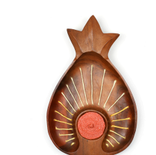
6 pine-appal 2025 Baling twine on timber pineapple 43 x 27.8 x 4.8cm $400