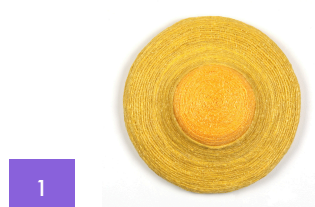
1 you are my son-shine 2024 Hand-coiled and stitched baling twine on timber frame 30.8 x 30.8 x 9.5cm $900

All works by Danish Quapoor + all photographs by Amanda Galea.