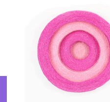
9 tumour target II (grandstanding) 2025 Hand-coiled and stitched twine and baling twine 20.5 x 20.5 x 7.5cm $800