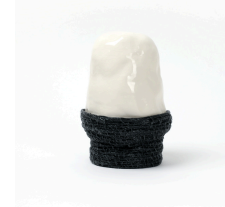
3 (Maybe not) opaque destiny (sentinel iv) 2024 Hand-coiled and stitched baling twine and porcelain paperclay with clear gloss glaze 13.5 x 8.5 x 8.5cm $400