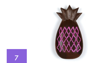
7 extra padding 2024 Baling twine on timber pineapple 24.8 x 12.6 x 3.5cm $280