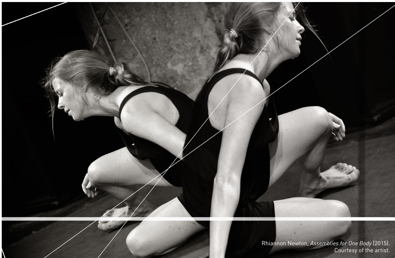
Rhiannon Newton, Assemblies for One Body (2015).