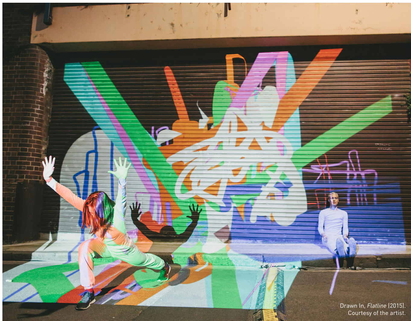
Drawn In, Flatline (2015).