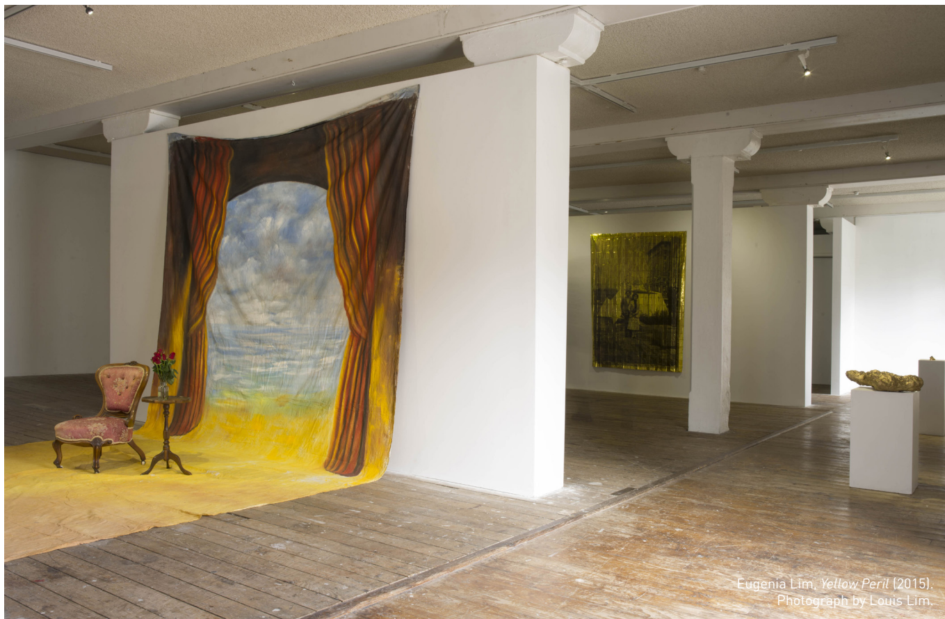
Eugenia Lim, Yellow Peril (2015).