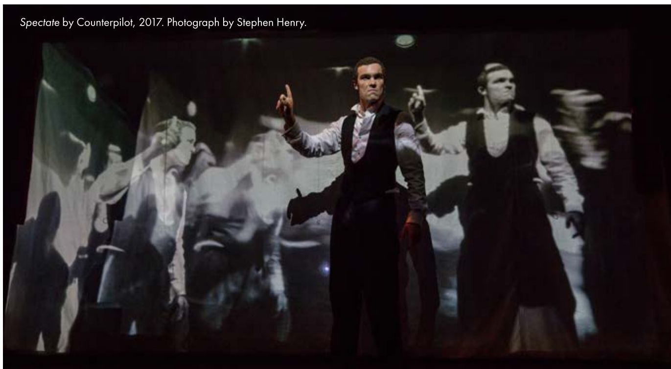
Spectate by Counterpilot, 2017.