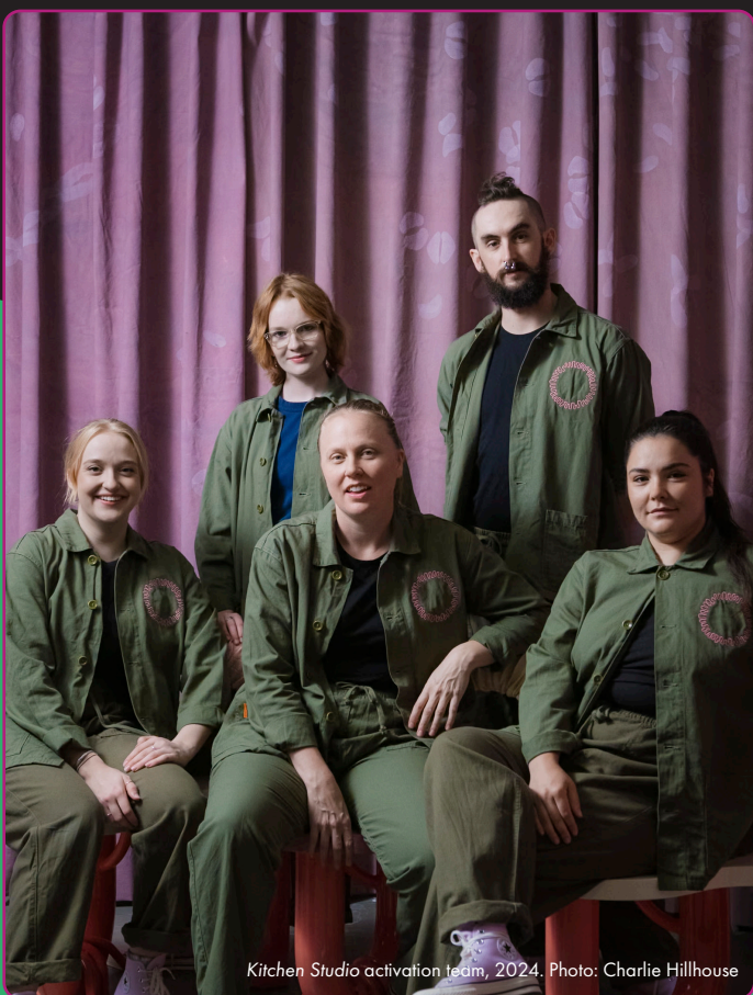
Kitchen Studio activation team, 2024.

"Metro Arts were the perfect partner for this project, open to new ideas, involved in mentoring, invested in development of my skills and the concept, attentive and sensitive to the creative process, and willing to assist wherever they could."