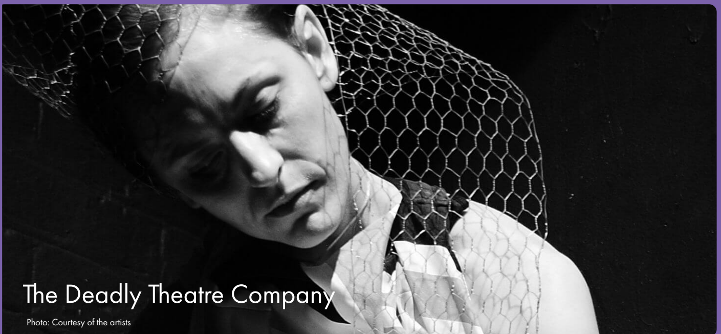
The Deadly Theatre Company