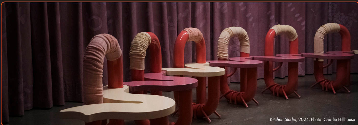
Kitchen Studio, 2024.