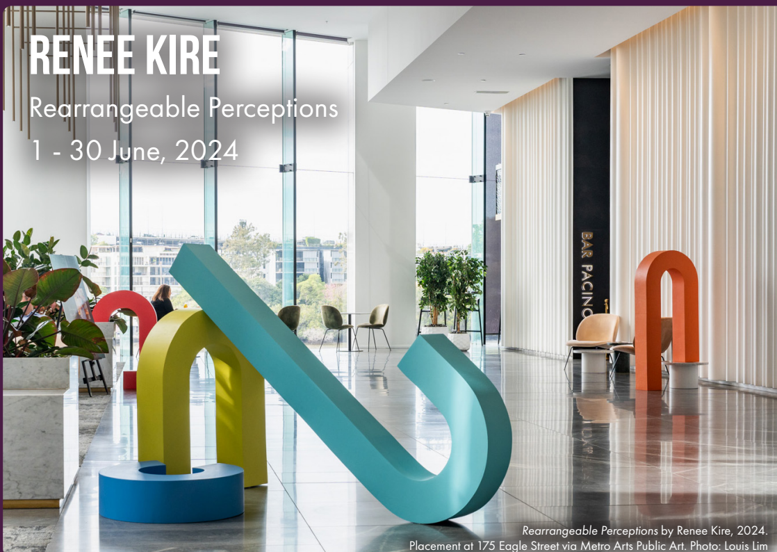
Rearrangeable Perceptions by Renee Kire, 2024. Placement at 175 Eagle Street via Metro Arts Public Art.