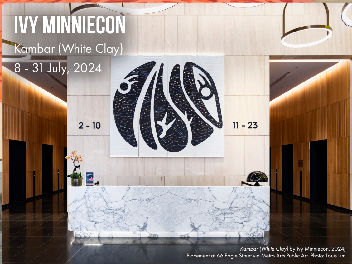
Kambar (White Clay) by Ivy Minniecon, 2024; Placement at 66 Eagle Street via Metro Arts Public Art.