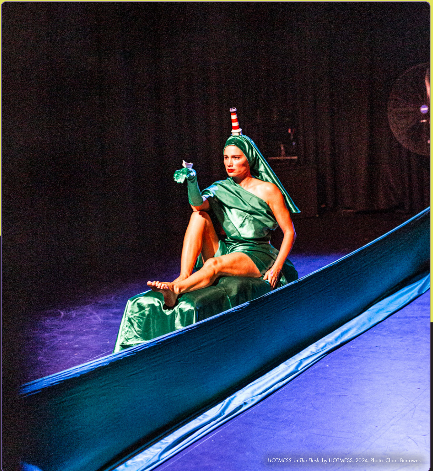
HOTMESS: In The Flesh by HOTMESS, 2024.