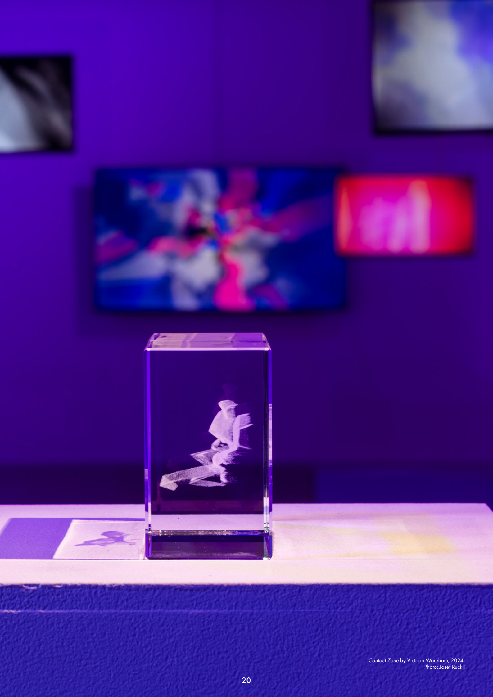
Contact Zone by Victoria Wareham, 2024.